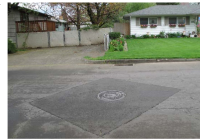
Figure 1. A UIC located in a public right of way.

The protection of groundwater in Oregon's program rests on monitoring the quality of stormwater. Drinking water standards such as MCLs (maximum contaminant levels) are used to determine the maximum allowable concentration of contaminants in stormwater. Oregon assumes that if stormwater entering the UIC does not exceed drinking water standards, groundwater quality is likely to be protected. Municipalities in Oregon operate their UIC Program under a permit from the Oregon DEQ. In June 2005, the DEQ issued a 10 year permit to Portland, which allowed stormwater discharges into city-owned UICs – the first permit of its kind in the nation. The permit established construction, operation and maintenance, and monitoring mandates for the UICs to ensure contamination prevention and groundwater replenishment.